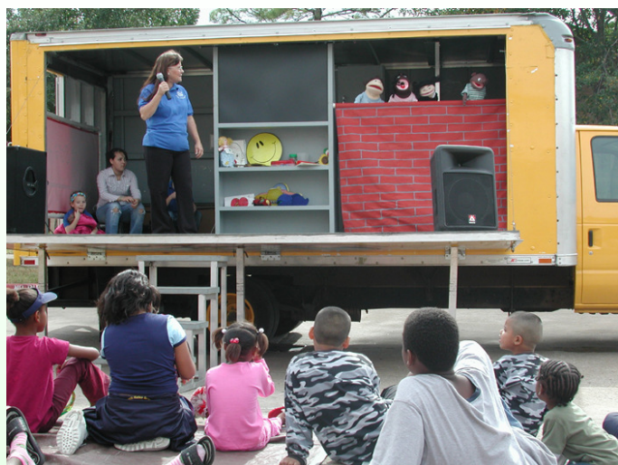
Puppets sing "Jesus Loves the Little Children" On Children's Activity Center Truck (CAT)