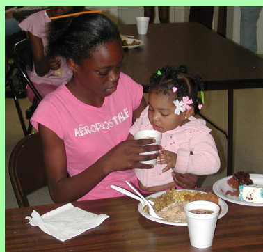
After the program all were invited to a free delicious Thanksgiving Dinner