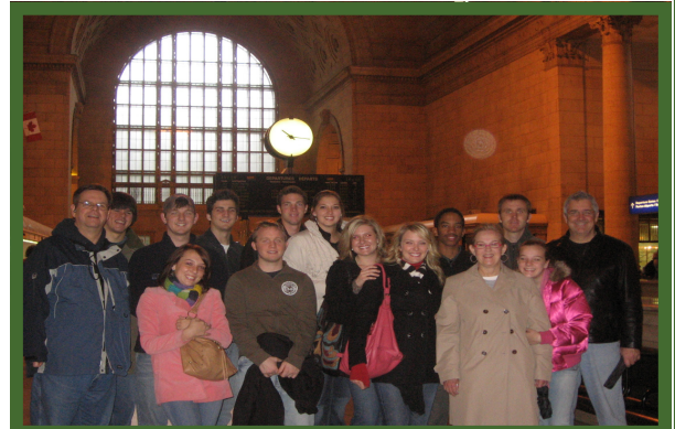
The whole Canada Team