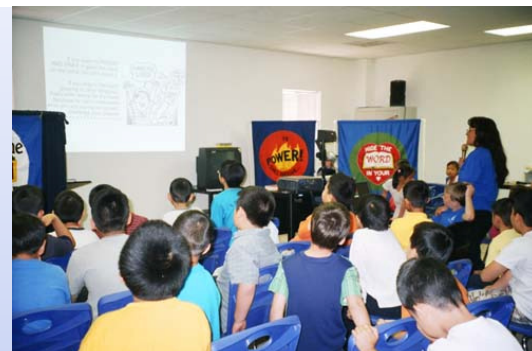
Powerpoint Teaching -TCA Conference Austin, Texas