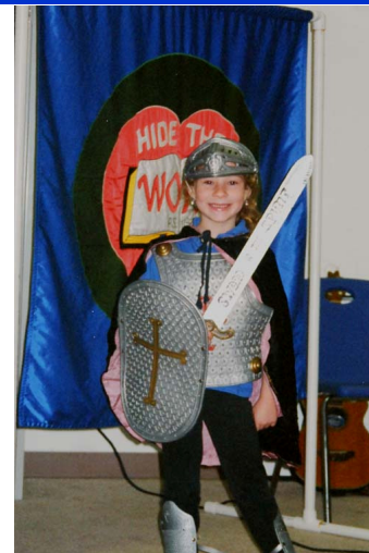
Miracle- Christian Soldier