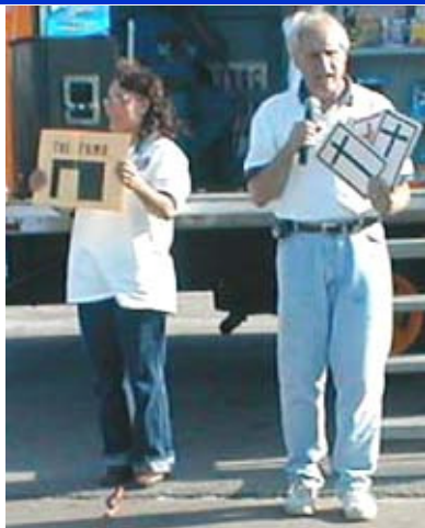
"He is Not Here! He Is Risen! Inner City Outreach

Star Family Singers, P. O. Box 6424, Katy, Tx 77491