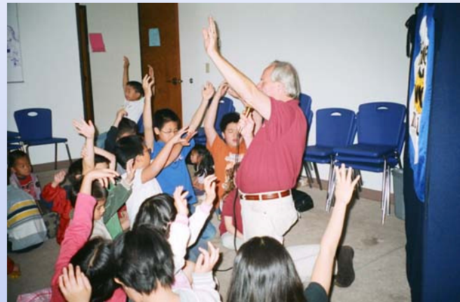
TCA Conference kids surrendering to Jesus!