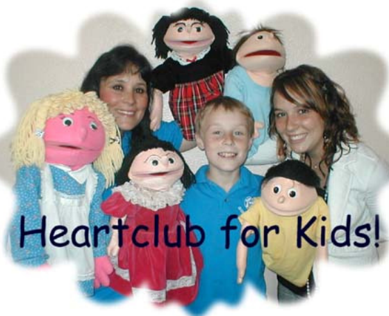
Our Summer China Team!