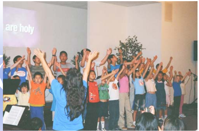
TCA Conference kids worshipping the Lord. "You are Holy!"