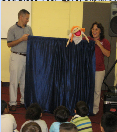
Puppet sings for Chapel at Central Christian Academy