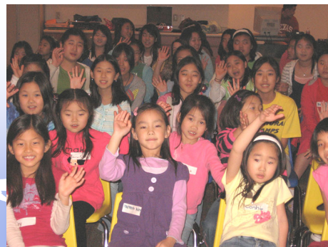
The girl's side!