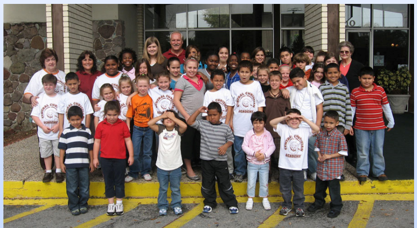
Central Christian Academy grades 1-6 join the Star Family to sing at two Nursing Homes

Heaven and earth shall pass away, but my words shall not pass away.