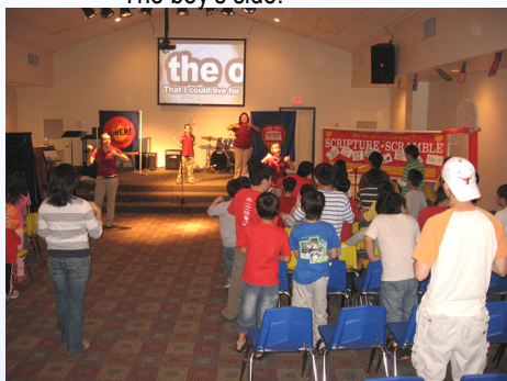
Star Family leading Praise and Worship