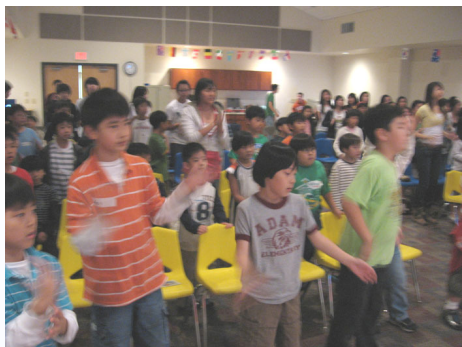
The boy's side!