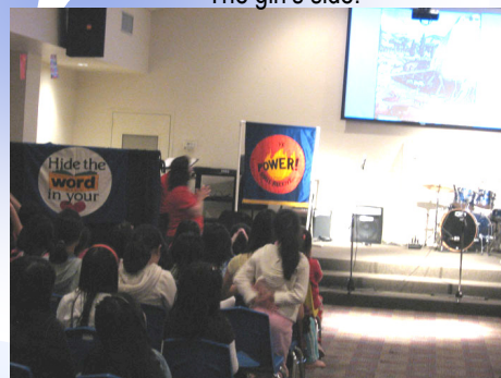
Teaching using power point presentations! Great tool for this media generation.