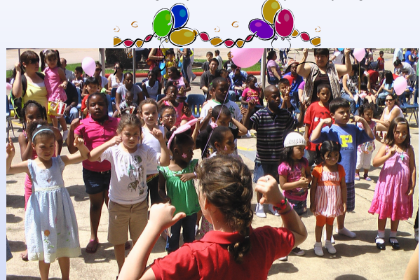
Children doing action songs with Miracle