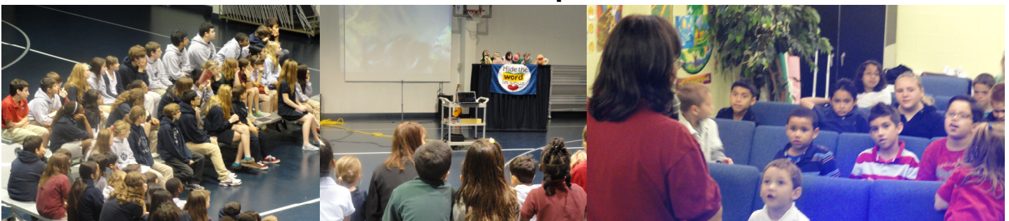
Ministering at school chapels for pre-K through High School