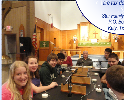
Bible Bowl Saturdays at 9:30 on 105.7