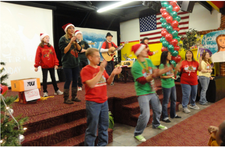
Star Family teaming up with the staff at Walking Faith to do Christmas Songs