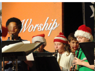
Miracle Band performance