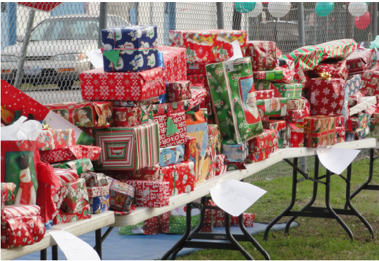
Gifts donated by churches for inner city kids to CAC