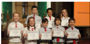
Miracle High Honor Roll