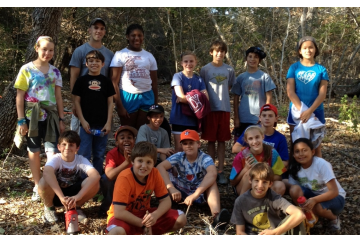
Miracle in tie dye shirt Camp Lonestar