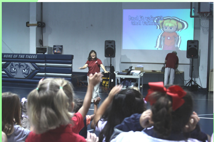
Action Songs for School Chapel