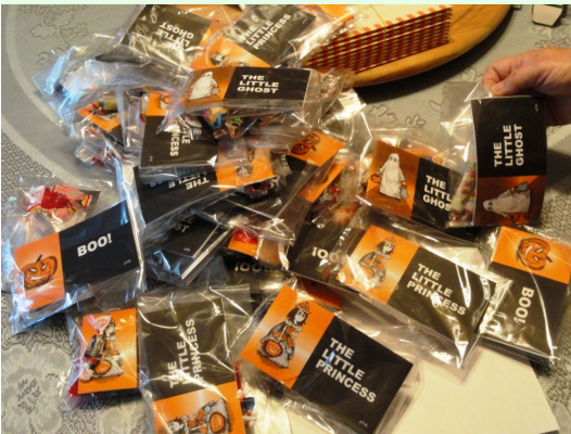
Chick Tracts in baggies of candy

She set up a little sound system for some lovely, lively music, went to Home Depot for a few knick knacks, bought some little plastic bags to put candy in and...yes "Happy Halloween" gospel comics for the kids.