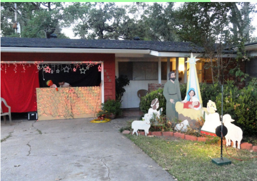
Driveway with manger scene Christmas lights and garage made into puppet stage for fishing for candy

Adria was armed and ready when I got home to help her with finishing touches. An 8' x 4' sheet of plywood stood on end to make our puppet house. Then a long wooden pole with string attached served as our fishing pole!