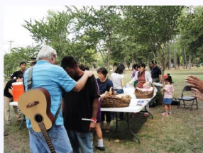
Stephen ministering one on one

Years ago a minister asked me, "But what will you do when all your 12 children are grown and gone from home?" "What will the ministry look like then?" I