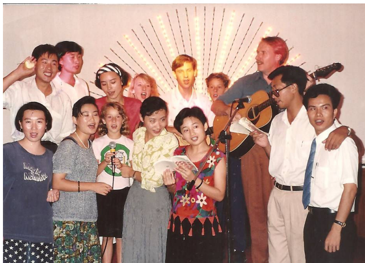
Karaoke Moon Festival Celebration featuring the Star Family. (Shenzhen China)

We were able to share songs and testimonies that night with about 30 of his friends who also spoke English. At the conclusion of our little program, each person in the room responded to the gospel call with raised hands. What a thrill to actually be in China and to see such hunger and receptivity among the people.