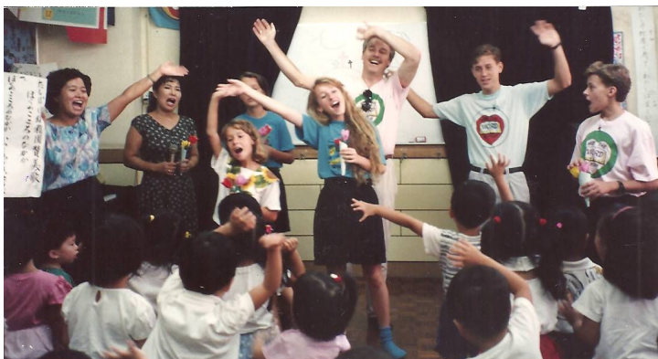
Learning new songs in Japanese with the children.

We were richly blessed to meet a precious thriving Japanese church in the midst of Hong Kong. What Christians these Japanese make! We saw many brothers coming from Japan with the sole purpose of carrying Bibles into China. Some have worn out their passports with visa stamps because they have made so many trips. We even met an 80 year old man who flew from Tokyo to help bring God's word to the hungry Chinese hearts. What a challenge to all of us.