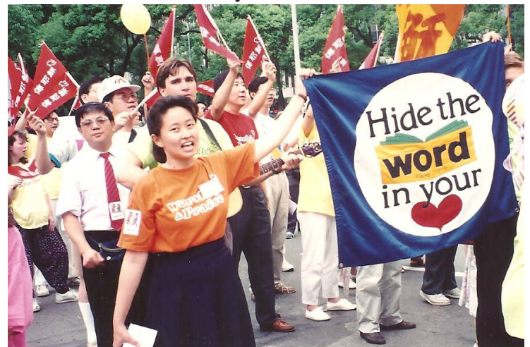
HWH Banner in "March for Jesus" Taipei Thousands of youth in rain & sunshine

The thousands of youth marched on the field with